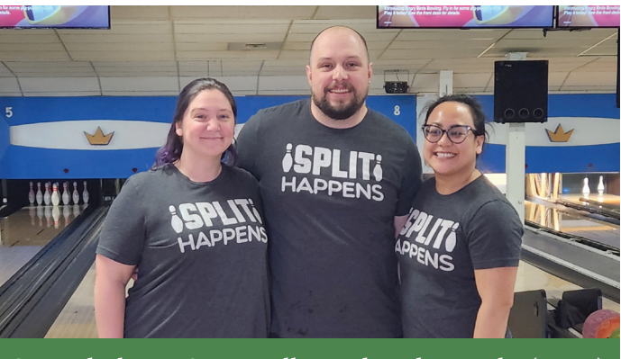
Second Place - Streetsville Wednesday Night (+104)