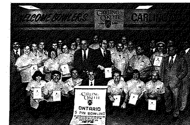
1978 GRAND AGGREGATE CHAMPIONS Hamilton District Bowlers Association