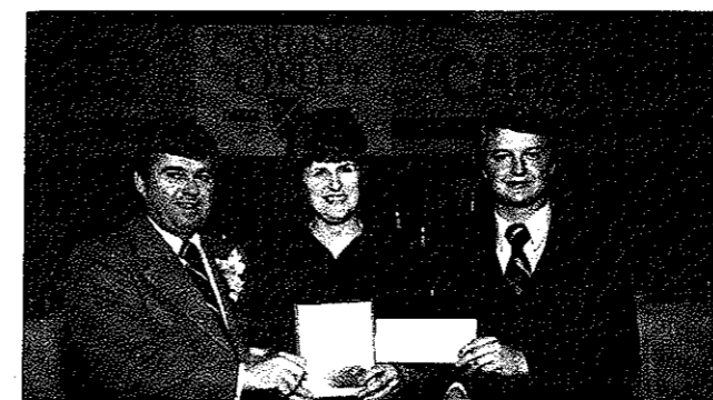
1978 LADIES SINGLES CHAMPION