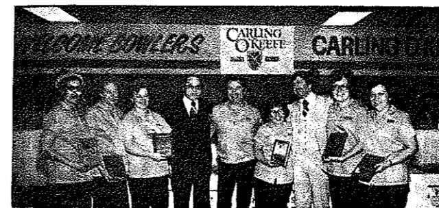
1978 LADIES TEAM CHAMPIONS