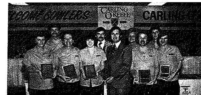
1978 MIXED TEAM CHAMPIONS