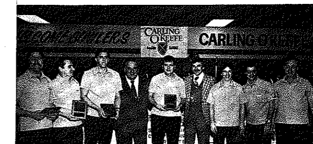
1978 MENS TEAM CHAMPIONS