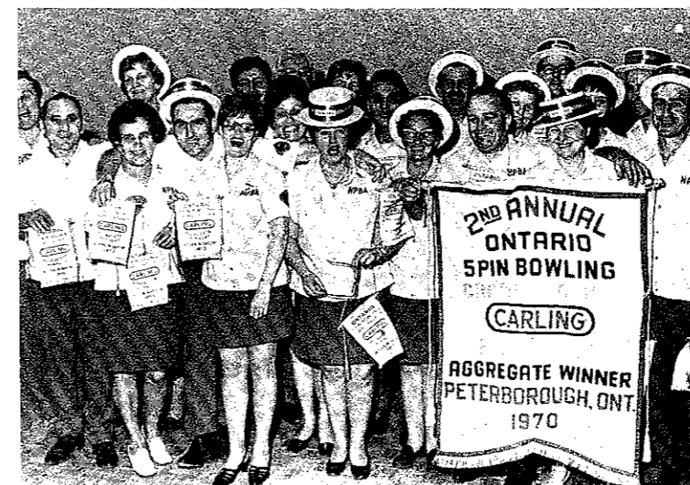
1970 Ontario Championships Aggregate Winners—NIAGARA PENINSULA ASSOCIATION.